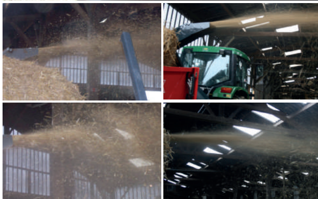
MULCHING WITHOUT AÉROLIB MULCHING WITH AÉROLIB